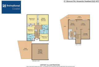
21 Woonum Rd, Asentia Headland QLD 4572